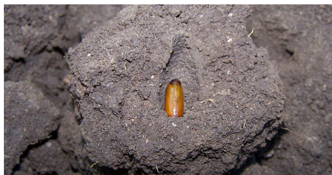
Pictured: Helicoverpa pupae in soil

Post harvest crop destruction works to reduce resistance risk by limiting the amount of time Helicoverpa are exposed to the toxins contained in Bt cotton outside of the cotton growing season. Resistance research shows that limiting season length is an effective tactic in extending the time until resistance develops.