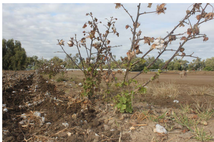
Pictured: Regrowth cotton

Pupae busting can be described as our 'last line of defence' at the end of the season to remove any potentially resistant individuals.